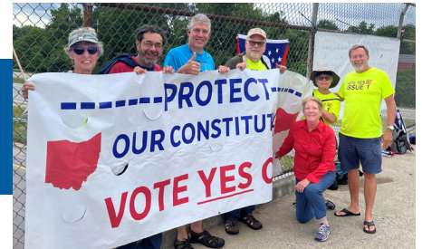
Our Bridge Team displaying an Issue 1 banner